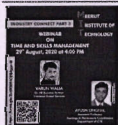
IC_PART 3.jpg 31K